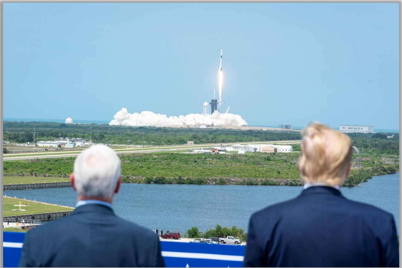
President Donald J. Trump and Vice President Mike Pence attend NASA's SpaceX Demonstration Mission 2 launch for the Commercial Crew Program at NASA's Kennedy Space Center on May 30, 2020.

“We are a nation of pioneers. We are the people who crossed the ocean, carved out a foothold on a vast continent, settled a great wilderness, and then set our eyes upon the stars. This is our history, and this is our destiny.”