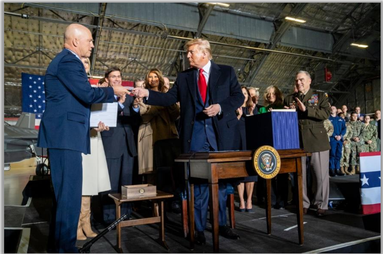
President Donald J. Trump greets General John W. “Jay” Raymond after signing the 2020 National Defense Authorization Act establishing the United States Space Force at Hangar 6 at Joint Base Andrews on December 20, 2019.