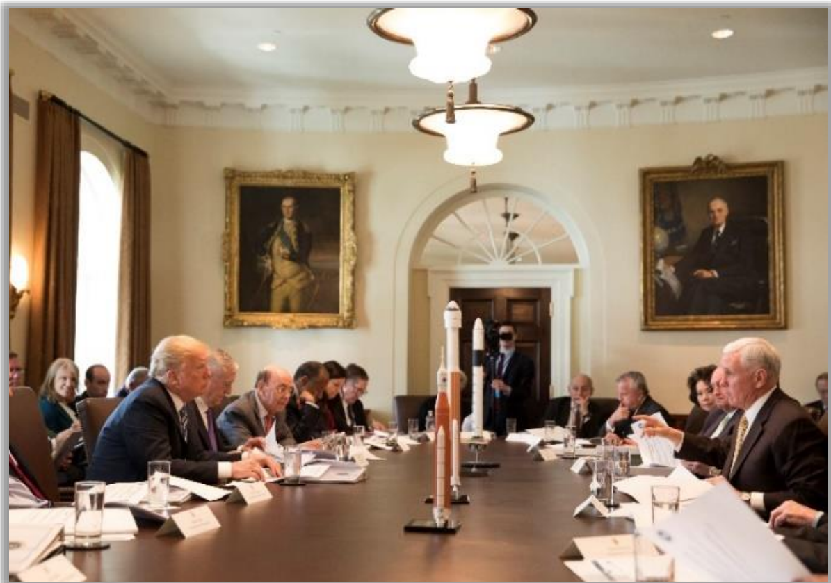
Vice President Mike Pence briefs President Donald J. Trump and members of the Cabinet in the Cabinet Room of the White House on March 8, 2018.