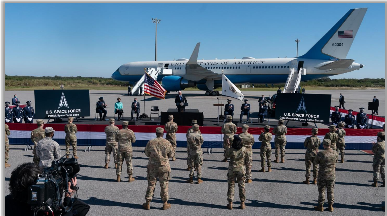
Vice President Mike Pence delivers remarks at a ceremony to re-designate existing U.S. Air Force installations as the first two installations of the United States Space Force at Cape Canaveral Space Force Station on December 9, 2020.

In standing up the newest Armed Service, the U.S. Space Force has achieved a number of significant milestones at a rapid pace: