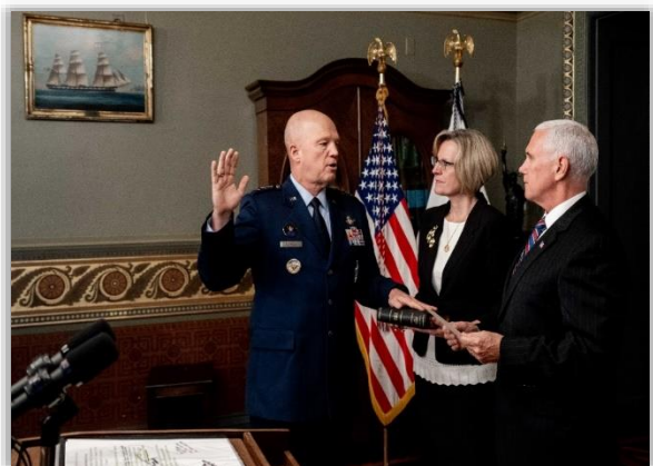
Vice President Mike Pence swears in General John W. “Jay” Raymond as the first Chief of Space Operations for the U.S. Space Force in the Vice President’s Ceremonial Office of the Eisenhower Executive Office Building at the White House on January 14, 2020.

develop advantages while U.S. interests in space are contested in this increasingly dynamic environment.