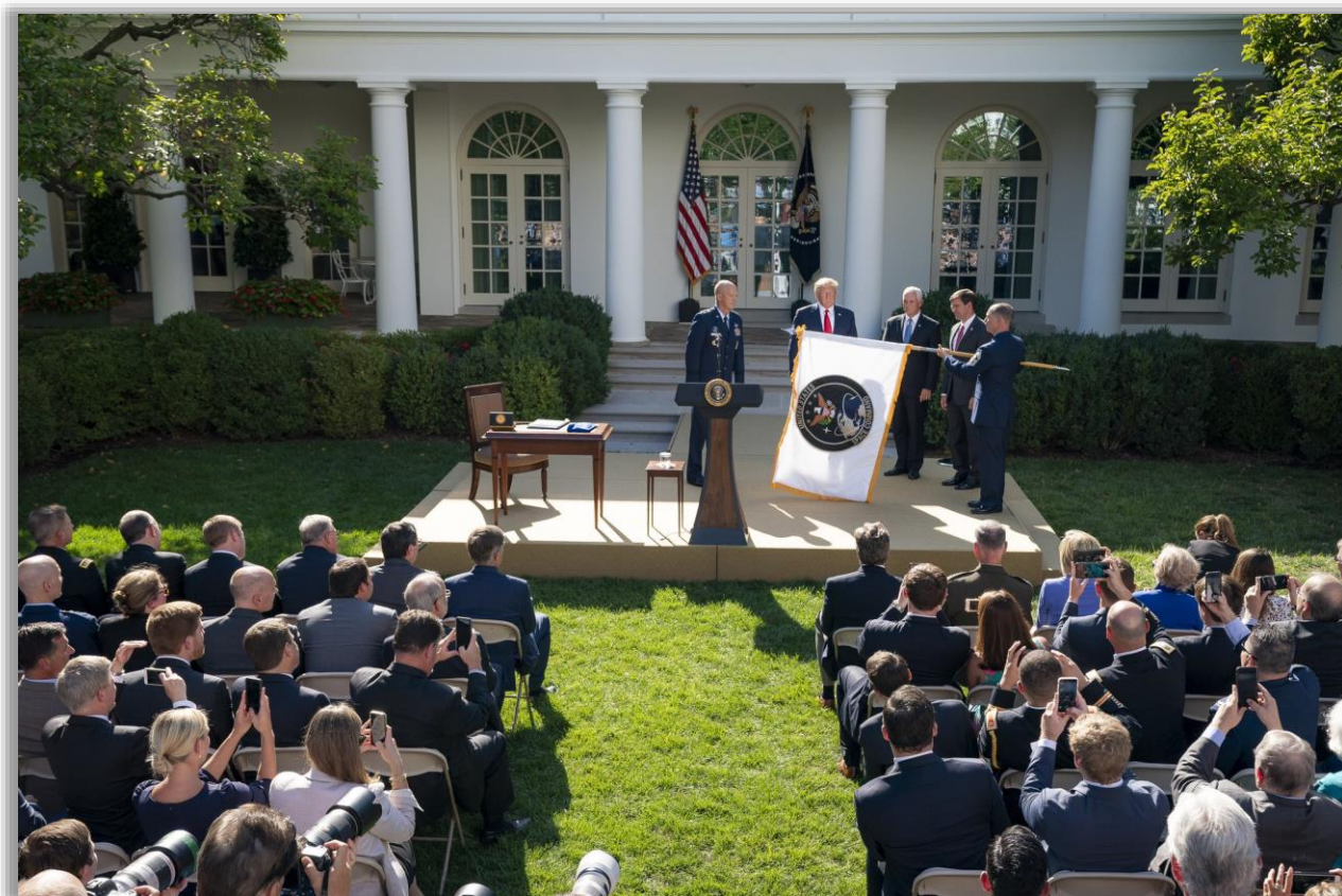
The flag of United States Space Command is unfurled during a ceremony in the Rose Garden at the White House on August 29, 2019.

The reestablishment of the United States Space Command as a Unified Combatant Command and the establishment of the United States Space Force as the sixth branch of the U.S. Armed Forces were significant efforts to effectively defend and protect American interests in all domains.