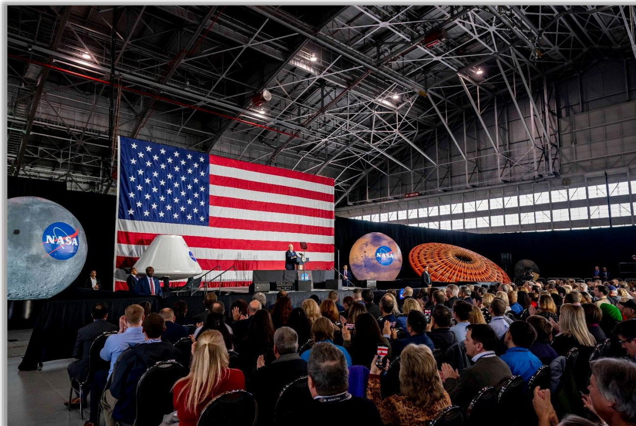
Vice President Mike Pence delivers remarks personnel and guests at NASA's Langley Research Center on February 19, 2020.

To preserve U.S. heritage in space, the Office of Science and Technology Policy issued a report on Protecting and Preserving Apollo Program Lunar Landing Sites and Artifacts in March 2018. This report outlines the global significance of the Apollo Program, and its cultural, scientific, and technological impact more than 50 years later and underlines the importance of the sites as a means to ensure this heritage is accessible to future generations. On July 20, 2019, people all around the globe commemorated humanity's first steps on another world during the celebrations surrounding the 50 th anniversary of the Apollo 11 lunar landing.