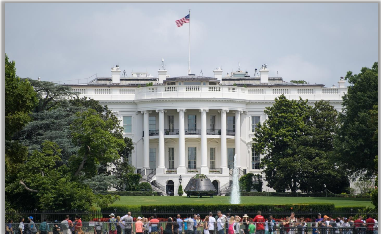
NASA's Orion spacecraft, produced by prime contractor Lockheed Martin, is seen on the South Lawn of the White House on July 22, 2018.