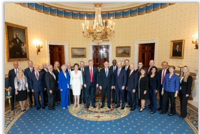
President Donald J. Trump and Vice President Mike Pence with members of the Users' Advisory Group on June 18, 2018, in the Blue Room of the White House.

The Council is supported by the Users' Advisory Group (UAG) , a Federal Advisory Committee composed of senior leaders and subject matter experts from industry, academia, and other non-federal entities representing the broader space community. Members of the UAG are appointed to two-year terms. The first members were appointed in June 2018. New appointments and re-appointments were made in June 2020. Since its first meeting on June 19, 2018, the UAG has regularly convened to provide valuable input to the National Space Council.