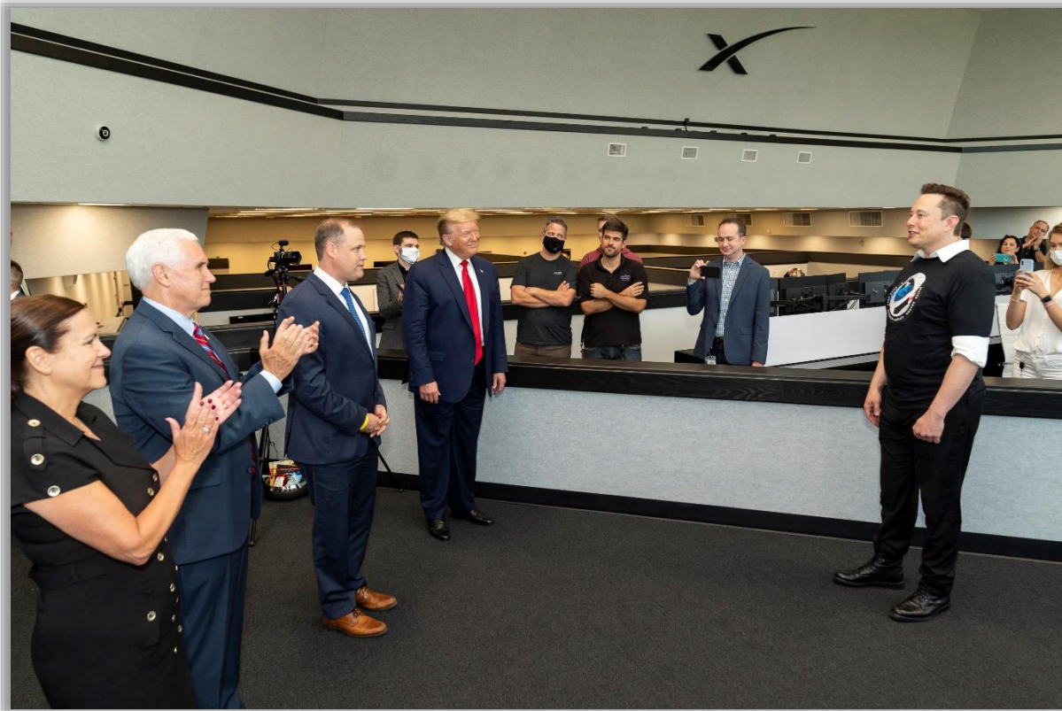
President Donald J. Trump, Vice President Mike Pence, Second Lady Karen Pence, and NASA Administrator Jim Bridenstine applaud SpaceX founder and CEO Elon Musk after the successful SpaceX Demonstration Mission 2 launch at NASA's Kennedy Space Center on Saturday, May 30, 2020.

In November 2020, NASA marked the twenty-year anniversary of continuous crewed operations on the International Space Station. Noting this remarkable achievement, prudent steps are being taken to prepare for the future of U.S. presence in low-Earth orbit once this national asset reaches its inevitable retirement. By harnessing American ingenuity and entrepreneurship, the United States is planning for a future that will involve multiple orbital platforms, at least some of which will be commercially operated. The United States foresees a future requirement for research, technology development, and crew training in low-Earth orbit, and is taking measures to increase commercial activity in this domain, which will allow the government to devote these resources to other critical exploration priorities.