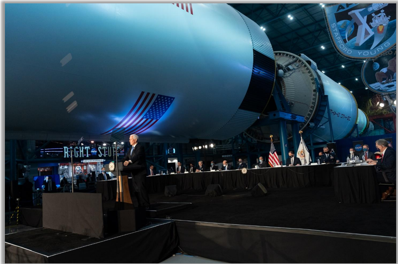
Vice President Mike Pence delivers remarks and chairs the Eighth Meeting of the National Space Council at NASA's Kennedy Space Center on December 9, 2020.