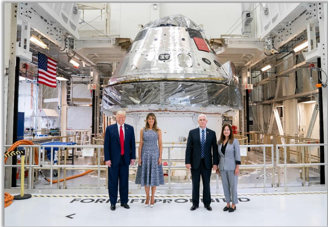
President Donald J. Trump, First Lady Melania Trump, Vice President Mike Pence, and Second Lady Karen Pence in front of the Orion capsule at NASA's Kennedy Space Center on May 27, 2020.

These bold goals were carried forward in the President's Budget Requests, which have resulted in some of the largest NASA budgets since the Apollo Program in the 1960s. Through the Artemis Program, NASA is developing its mission architecture, commercial and international partnerships, and budget requests to ensure the proper resources and programs are in place for sending humans to the surface of the Moon.