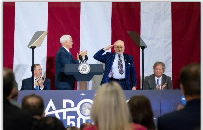
Vice President Mike Pence and Apollo 11 astronaut Buzz Aldrin at the commemoration of the 50 th anniversary of Apollo 11 at NASA's Kennedy Space Center on July 20, 2019.

In addition to elevating public awareness of the mission and achievements of NASA, the National Space Council leveraged the broad array of government expertise at the Departments of State, Defense, Commerce, Transportation, and Energy to strengthen and expand the Nation's civil space enterprise.