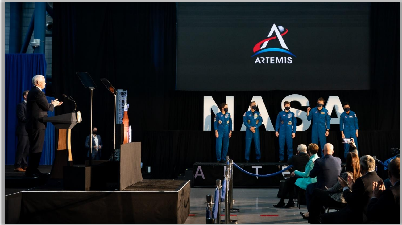
Vice President Mike Pence announces the names of the first cadre of astronauts for NASA's Artemis Program at NASA's Kennedy Space Center on December 9, 2020.