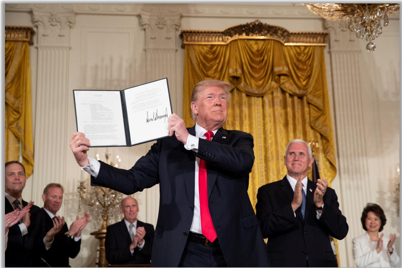
President Donald J. Trump signs Space Policy Directive 3 at the Third Meeting of the National Space Council in the East Room of the White House on June 18, 2018.

thousands. New technological advancements are not only increasing the number of American satellites, but prolonging the operational life of satellites already in orbit. Between February 25, 2020, and April 2, 2020, Northrop Grumman's Mission Extension Vehicle 1 became the first spacecraft to rendezvous with, service, and reposition another satellite to extend its useful life.