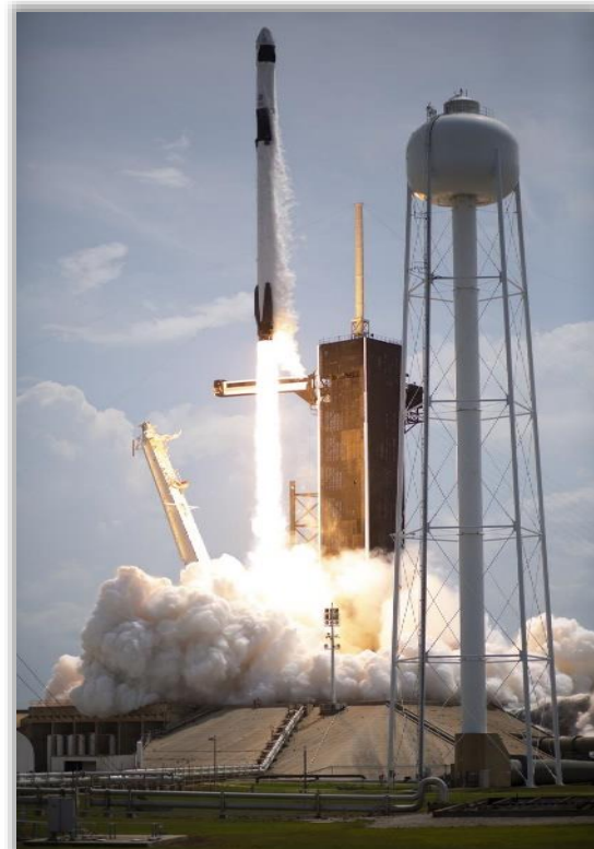
A SpaceX Falcon 9 rocket is launched from Launch Complex 39A for NASA's SpaceX Demo-2 mission to the International Space Station with NASA astronauts Robert Behnken and Douglas Hurley aboard at NASA's Kennedy Space Center on Saturday, May 30, 2020.

extension of U.S. presence from low-Earth orbit, a return to the Moon for a sustainable presence, and missions to Mars and beyond. The report lays out necessary steps to achieve a truly American future in space, recognizing that it is not merely American machines and astronauts that constitute U.S. space activities, but American values as well.