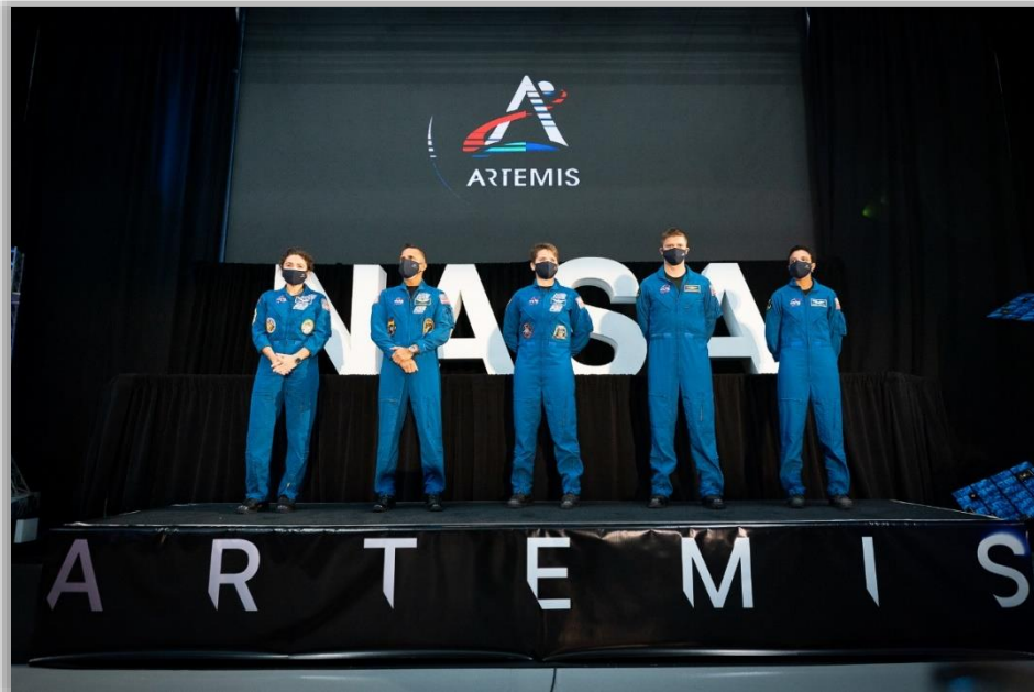
Five members of the first cadre of astronauts for NASA's Artemis Program are recognized after their names are announced by Vice President Mike Pence at NASA's Kennedy Space Center on December 9, 2020.