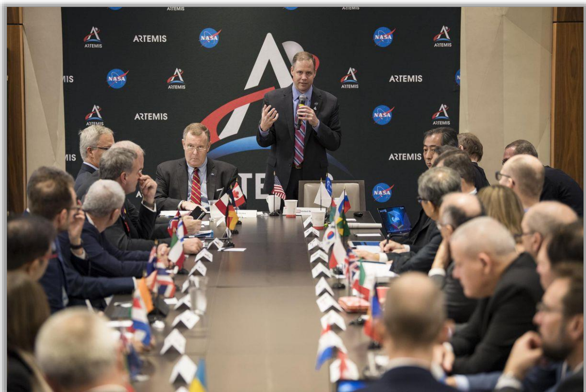
NASA Administrator Jim Bridenstine speaks with the heads of international space agencies at the 2019 International Astronautical Congress in Washington, D.C.

On July 27, 2020, officials from the Departments of State, Defense, and Energy, as well as the National Security Council, met with Russian Federation officials in Vienna, Austria, for a Space Security Exchange under the framework of the Strategic Security Dialogue, the first of its kind in seven years.