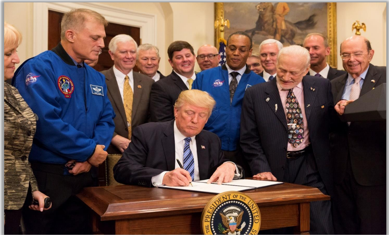
President Donald J. Trump signs Executive Order 13803, Reviving the National Space Council in the Roosevelt Room of the White House on June 30, 2017.