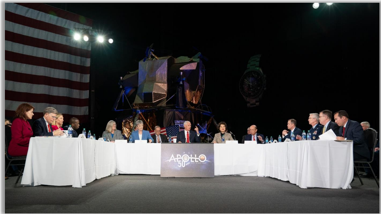
Vice President Mike Pence chairs the Fifth Meeting of the National Space Council at the U.S. Space and Rocket Center in Huntsville, Alabama, on March 26, 2019.

This recommendation paved the way for the first Space Policy Directive on December 11, 2017. Space Policy Directive 1 (SPD-1), Reinventing America's Human Space Exploration Program, states that the United States will: