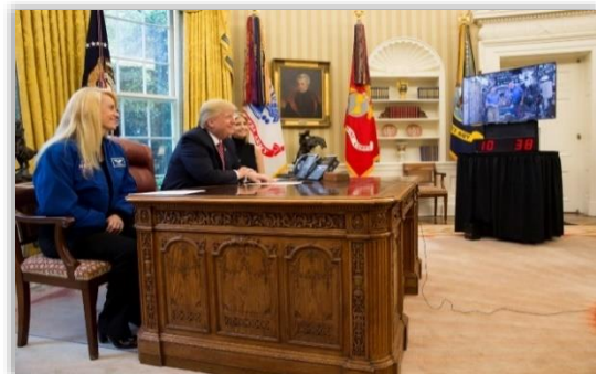
President Donald J. Trump, alongside Ivanka Trump and NASA astronaut Kate Rubins, speaks with NASA astronauts Peggy Whitson and Jack Fischer aboard the International Space Station, in the Oval Office on April 24, 2017, to congratulate Commander Whitson for breaking the record for most time in space of any American astronaut.

“Consistent with the overall goals of SPD-1, the United States will seek to land Americans on the Moon’s South Pole by 2024, establish a sustainable human presence on the Moon by 2028, and chart a future path for human Mars exploration. NASA’s lunar presence will focus on science, resource utilization, and risk reduction for future missions to Mars.”