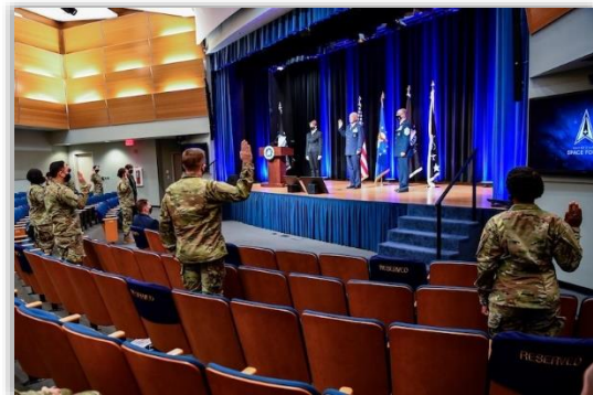
Chief of Space Operations Gen. John W. Raymond administers the oath of office to airmen transferring into the U.S. Space Force during a ceremony at the Pentagon on September 15, 2020.

On February 12, 2020, the President issued an Executive Order on Strengthening National Resilience through Responsible Use of Positioning, Navigation, and Timing Services. This order seeks to protect the national and economic security of the United States and its partners by ensuring reliable and efficient function of the Global Positioning System (GPS) and related critical infrastructure. The United States continues to make GPS services available worldwide as a free service, which has offered immense global value for communications, security, commerce, agriculture, transportation, mobility, weather, and emergency response. However, dependence on this invisible utility and its widespread adoption require protection from disruption and manipulation to ensure national resilience.